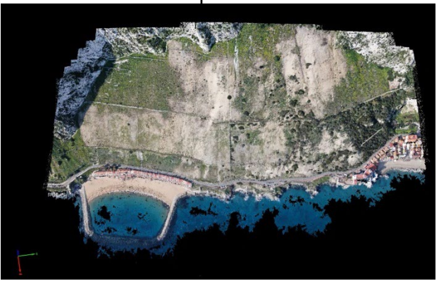
1. Eastern catchment slopes with gull colony, Gibraltar Gov.

• We first visited Gibraltar between the 25<sup>th</sup> and the 28<sup>th</sup> of September 2022. The territory has been very receptive and appeared ahead in terms of equipment and training, so we decided to use them as proof of concept. The trip was very positive and allowed us to identify gaps for our methods to be adapted to monitoring seabirds in warmer climates and to prove that the method should be reproducible with a few edits.