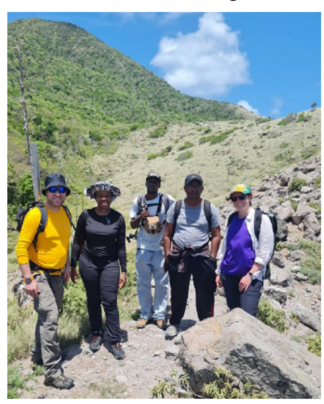
6. Field trip to Montserrat with our colleagues at the Montserrat Department of the Environment