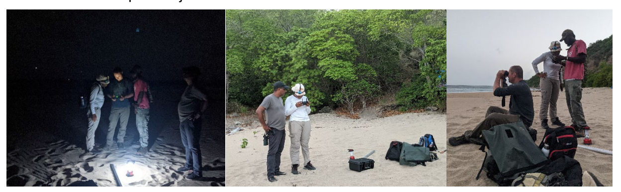
9. Testing infrared to monitor nocturnal seabirds like Audubon's Shearwaters with the team from the Department of the Environment.

As part of the visit, we will also conduct a recce of the sea turtle colony to better understand the terrain and explore what monitoring technique can be used or if, like Ascension Island, we would need to explore the possibility to develop new hardware with the help of Project Arribada.