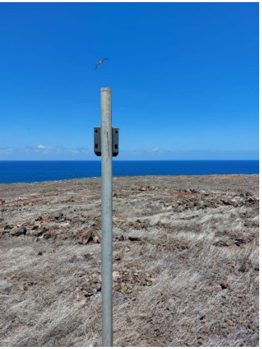
4. Time-lapse camera on Mars Bay Nature Reserve overlooking a Sooty tern colony, Ascension Island

We have been working with our local partner to ship 12 time-lapse cameras, chargers, and memory cards) before the seabird breeding season. Unfortunately, it is not currently practical for us to visit the territory as flights remain limited due to runway refurbishment. We trust that our partner has the right skills and have provided some remote training and resources for camera set-up and positioning. Some have already been installed in Mars Bay Nature Reserve to capture the 2023 breeding season and we aim to send long-range cameras in the next few months too.