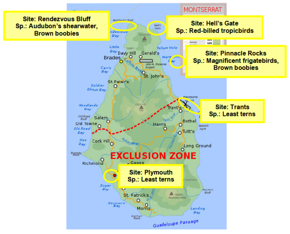
8. Map of Montserrat

• After discussing with Montserrat, we have also decided to attempt to create an artificial colony for the least terns (Sternula antillarum). They have been observed nesting on an industrial jetty within the local protected area in 2022 but, unfortunately, the eggs were destroyed by construction vehicles. We aim to place an extension to the jetty which can be fenced to avoid disturbances from passing vehicles. We would be using a playback device to attract the breeding pairs and a camera to observe any attempt at nesting. To date, it is not clear if and where on the island the species may be breeding despite having been observed foraging around the island.