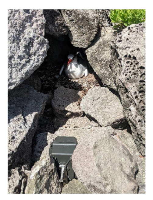
7. Time-lapse camera overlooking a red-bellied tropicbird nest as a pilot for cavity-nester monitoring. This method will help local partners to better assess breeding success and the level of invasive species predation.

• After discussing with Montserrat, we have also decided to attempt to create an artificial colony for the least terns (Sternula antillarum). They have been observed nesting on an industrial jetty within the local protected area in 2022 but, unfortunately, the eggs were destroyed by construction vehicles. We aim to place an extension to the jetty which can be fenced to avoid disturbances from passing vehicles. We would be using a playback device to attract the breeding pairs and a camera to observe any attempt at nesting. To date, it is not clear if and where on the island the species may be breeding despite having been observed foraging around the island.